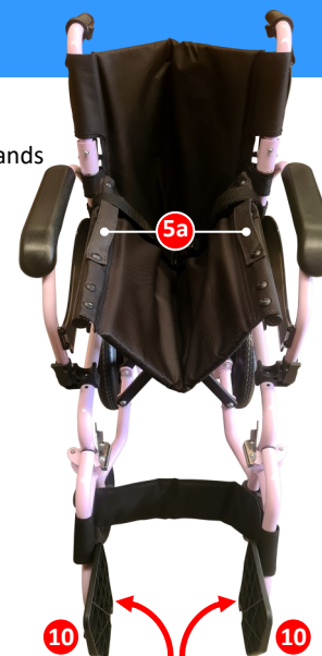
Figure B. Unfolding / Folding

Step 1: Turn up both footplates (10). Step 2: Fold the wheelchair by pulling up the handles (5a) on the sides of the seat.