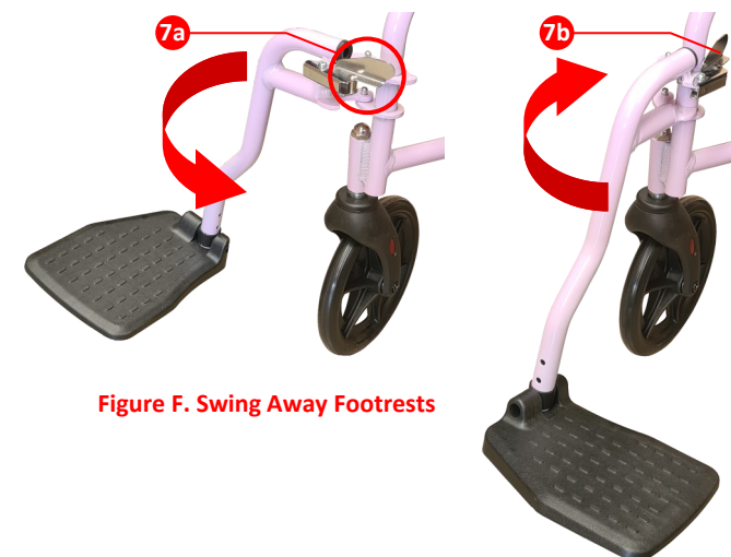
Figure F. Swing Away Footrests