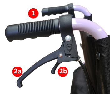
Figure C. Attendant Brake

(Figure C): Squeeze (2a) upward to apply brakes. Brakes lock when (2b) clicks in. Squeeze (2b) upward to release brake lock.