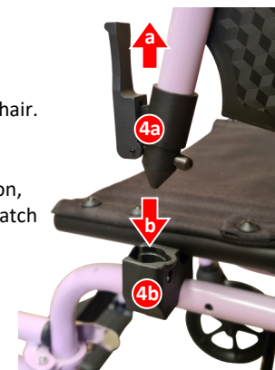
Figure E. Flip Up Armrests

To return armrest to down position, push armpad down until release latch (4a) locks firmly into place (4b).